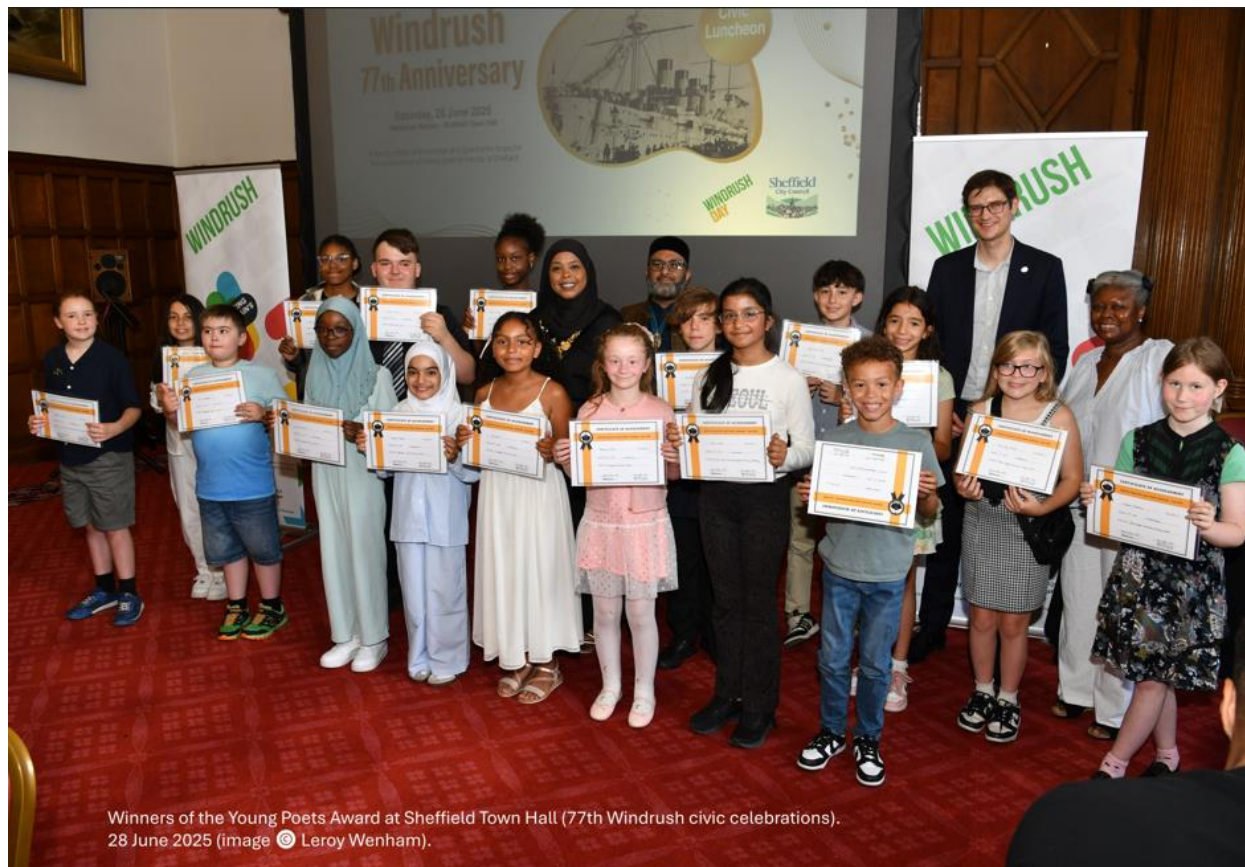
Winners of the Young Poets Award at Sheffield Town Hall (77th Windrush civic celebrations). 28 June 2025.

The gold awards in each category were given on Saturday 28 June at the Town Hall as part of a civic afternoon tea for elders from Sheffield's Windrush communities. The silver and bronze prizes and certificates are being distributed to the settings who took part along with distribution of the anthology of poems that has been created.