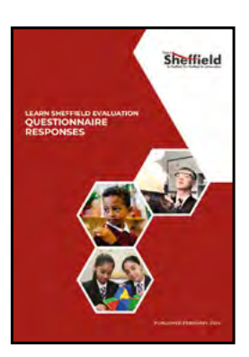
Learn Sheffield Questionnaire Responses 2023